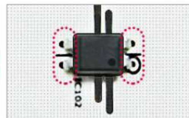
When applying circuit protection coating