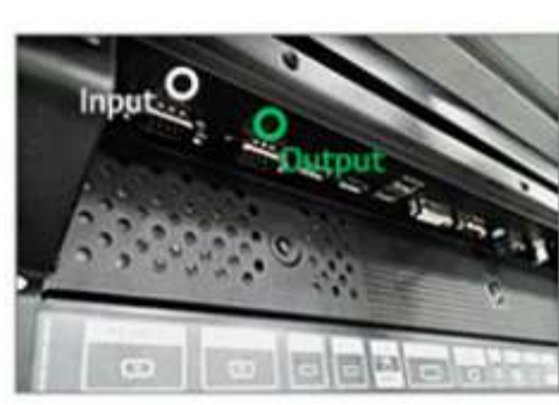
Classified In/Out Port

Provides a variety of options for ease of use and installation